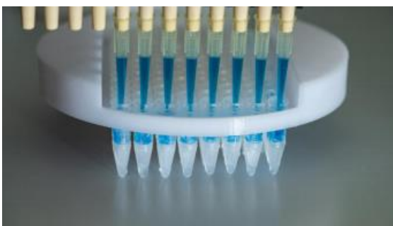
Figure 2: Filling the DiaEasy™ Dialyzer Tubes in 96-well format with a multi-channel pipettor.