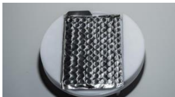
Figure 3: Sealing the DiaEasy™ Dialyzer tubes in 96-well format with the included aluminum foil adhesive sealer. Ensure that the rim of each tube is in contact with the sealer.