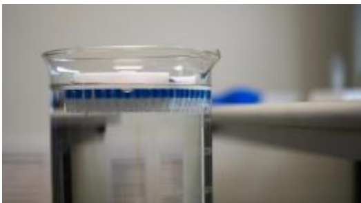
Figure 4: Dialysis with the DiaEasy™ Dialyzer in 96-Well Format.