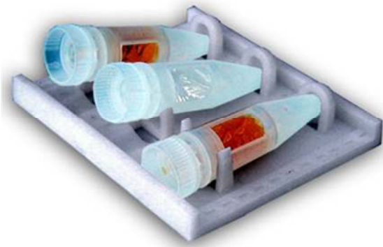
Figure 2: Insertion of the DiaEasy™ Dialyzer tubes in the provided supporting tray. The arrow on the cap is positioned face-up.