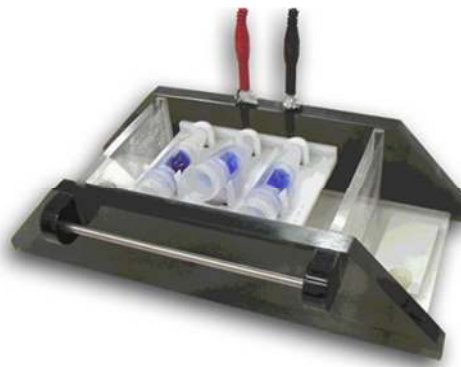
Figure 3: Supporting tray containing three DiaEasy™ Dialyzer tubes in a horizontal electrophoresis tank. The arrow on the cap is positioned face up and the two membranes of the DiaEasy™ Dialyzer tubes are in perpendicular to the electric field.

VIII. Sample concentration by evaporation with DiaEasy™ Dialyzer tubes: DiaEasy™ Dialyzer tubes are ideally suited for sample concentration via evaporation because of their dual membranes and large surface area. Dialysis and concentration in the same device reduces protein loss. Unlike closed-system centrifuge-type devices, sample concentration can be easily monitored in the DiaEasy™ Dialysis tubes.