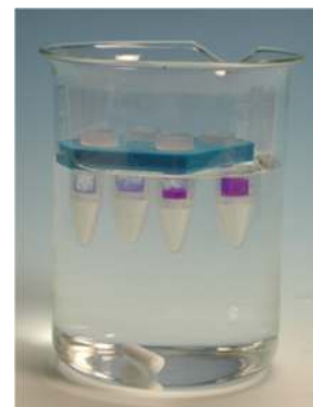
Figure 1: Dialysis with DiaEasy™ dialyzer tubes