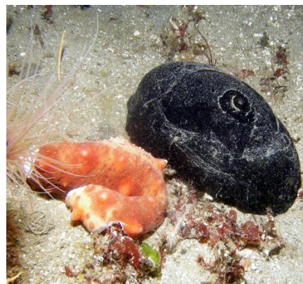
Megathura crenulata , Giant keyhole limpet

Hemocyanins are proteins in the hemolymph of a variety of arthropods and mollusks that use copper binding sites to bind and transport oxygen. As one of the strongest antigens known, hemocyanin is used as an immunological reagent and as a carrier protein for antibody production against antigens. Recent advances in immunology and the role immune system plays in diseases have opened a whole new era of product development activities aimed at developing novel therapeutics for teaching the body's immune system to fight diseases. The approach involves the use of highly immunogenic molecule like the hemocyanin for non-specific immunostimulation (NSI) or active specific immunostimulation (ASI) using conjugate vaccines, wherein the tumor (disease) specific antigens are covalently bound to carrier protein like KLH and the product used in human clinical studies. BioVision's native KLH has low endotoxin content and consistent high concentration in a phosphate buffer containing no extraneous metal ions for product stability. This research grade material is suited for use in vaccine product development activities and also for routine immunological studies, antibody production, production of activated KLH and other developmental activities.