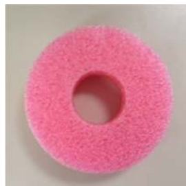
Figure 1: DiaEasy™ Dialyzer (10, 15, 20 ml) Floating rack.